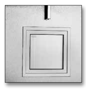
Viewports allow visibility of products stored inside.