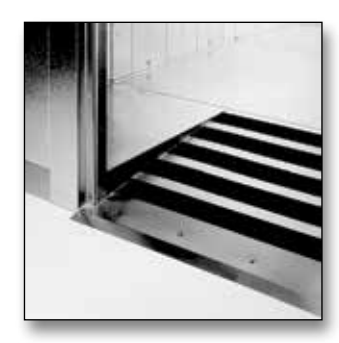
Interior ramps* make it easy to roll items directly into your walk-in.