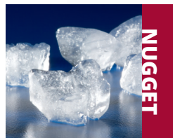
RNP0320 nugget ice machine on a beverage dispenser