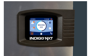
easyTouch ® Display