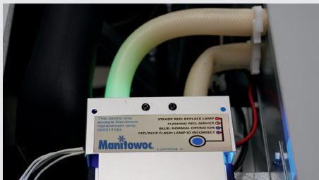
Without LuminIce II

The LuminIce II space-saving design fits inside the ice machine so existing exterior clearances are not impacted. In addition, power for the unit is supplied through the ice machine's internal electrical supply so outlet space is conserved.