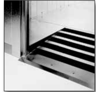
Interior ramps* make it easy to roll items directly into your walk-in.