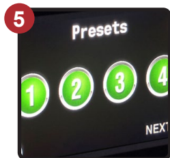
8 Programmable Presets