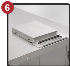
Automatic Venting Baffle