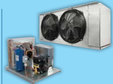
SPLIT-PAK™** REMOTE INDOOR & OUTDOOR Systems ranging from .5 to 6 HP

PATENTED TECHNOLOGY U.S. Patent No. 11,859,885