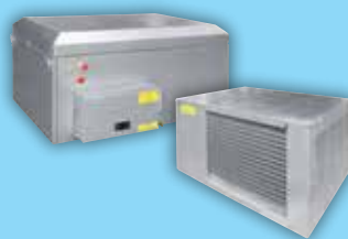
CAPSULE PAK™* REMOTE INDOOR & OUTDOOR Quick-connect systems up to 2 HP