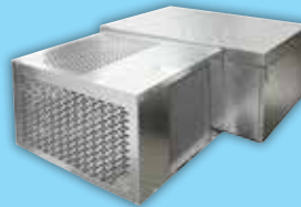
CAPSULE PAK ECO™* SELF-CONTAINED INDOOR & OUTDOOR