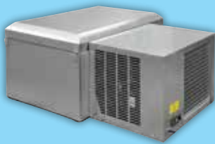
CAPSULE PAK™* SELF-CONTAINED INDOOR & OUTDOOR