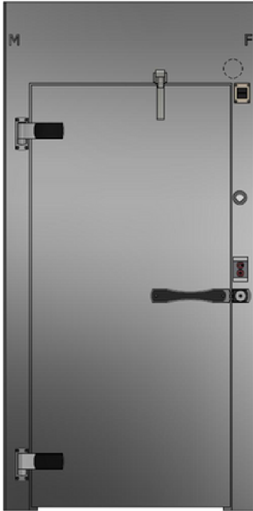
Steel frame construction and design