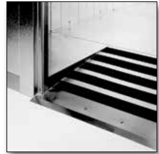
Roll items directly into your walk-in with interior ramps*.