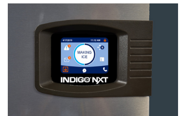
easyTouch ® Display