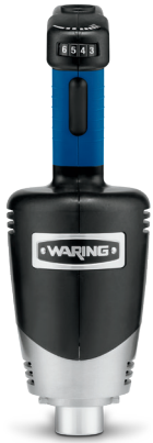
WSB40XPP Power Pack