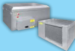
CAPSULE PAK™* REMOTE INDOOR & OUTDOOR Quick-connect systems up to 2 HP