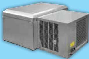
CAPSULE PAK™* SELF-CONTAINED INDOOR & OUTDOOR