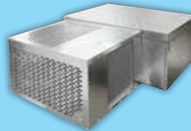
CAPSULE PAK ECO™* SELF-CONTAINED INDOOR & OUTDOOR