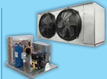
SPLIT-PAK™** REMOTE INDOOR & OUTDOOR Systems ranging from .5 to 6 HP

PATENTED TECHNOLOGY U.S. Patent No. 11,859,885